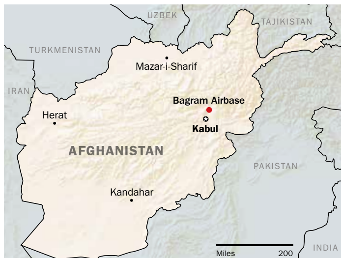
Map of Afghanistan showing the location of Bagram Airbase.

Because of the still present threat of enemy ground attack or indirect fire, the command placed special emphasis on force protection measures to counter those actions. In addition to laying protective wire and constructing fighting positions, plans and procedures were formulated for base defense. Although soldiers of the 10 th Mountain Division (MD) assumed overall responsibility for protecting the Bagram area, the CJSOTF-A headquarters organized its own local security force from available support personnel and it operated around the clock. The security force guarded