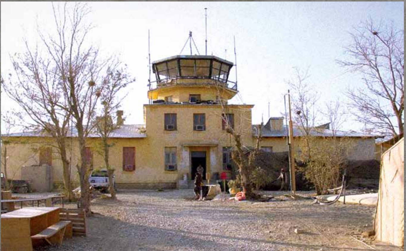
The Soviet Union constructed a control tower at Bagram Airbase in 1976 and used it until 1989 when they abandoned the area. When coalition forces seized the base from the Taliban in October 2001, a Special Forces Operational Detachment-Alpha (ODA) used the tower as an observation post to call in close air support (CAS) to assist the friendly indigenous forces defeat Taliban troops entrenched in the surrounding plains. U.S. Air Force Air Traffic Controllers put the tower back into service.