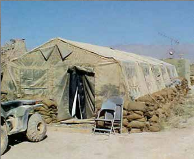
Tent that housed the CJSOTF-A Base Defense Operations Center (BDOC).