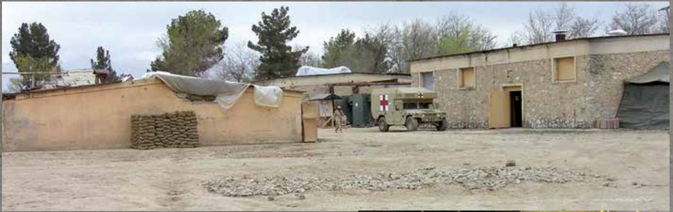
Exterior of the CJSOTF-A aid station set up and manned by personnel of the Medical Platoon, Group Support Company, 3rd Special Forces Group, April 2002.