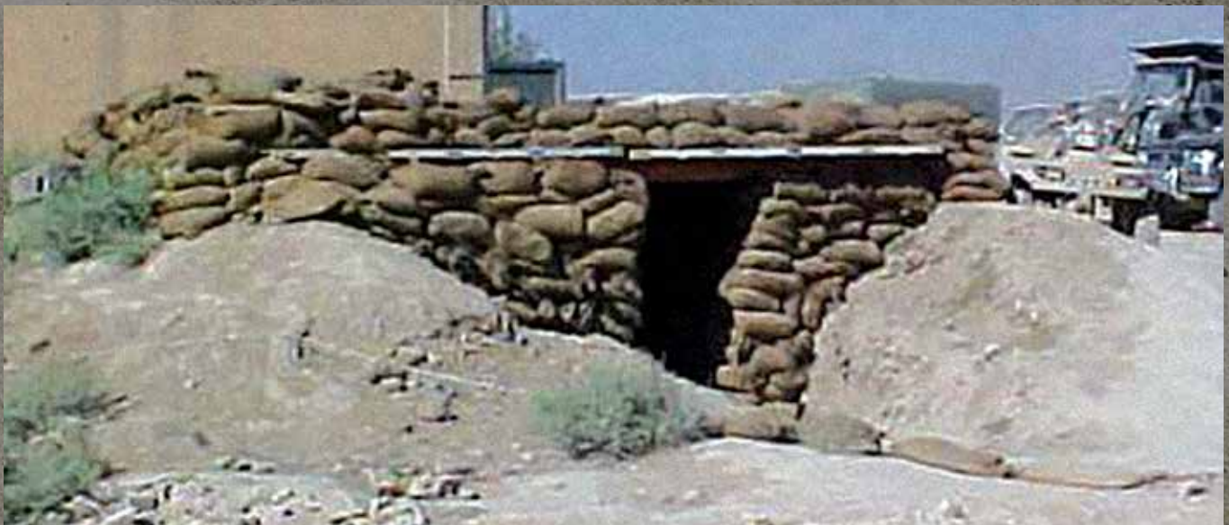
Expedient bunker to provide protection from indirect fire attacks. Over time, these were replaced with above-ground concrete and sandbag bunkers. In those early days the troops experienced random direct fire attacks which were gradually replaced with sporadic monthly indirect rocket or mortar attacks.