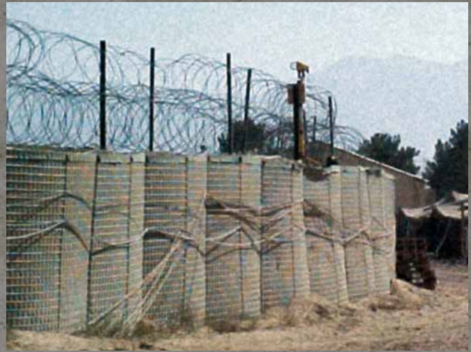
Photo showing a portion of the HESCO perimeter wall around the CJSOTF Headquarters in April 2002. Note the addition of lighting for night operations. Surveillance cameras were installed to allow guards to remotely view sectors without exposing themselves to direct fire weapons.