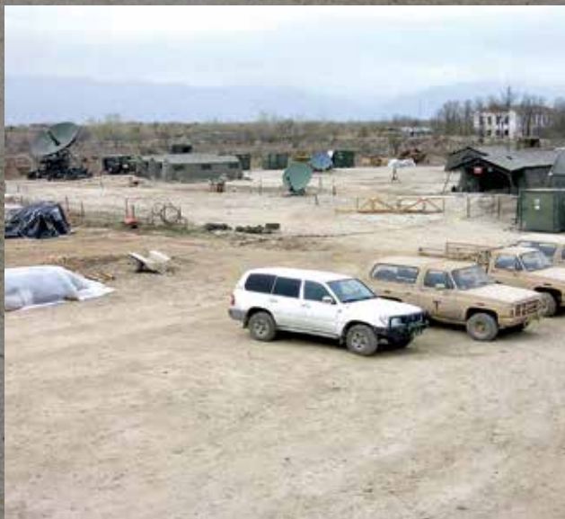
Location of the 3rd Special Forces Group Signal Detachment (SIGDET) on the CJSOTF-A compound, Bagram Airbase, Afghanistan, May 2002.