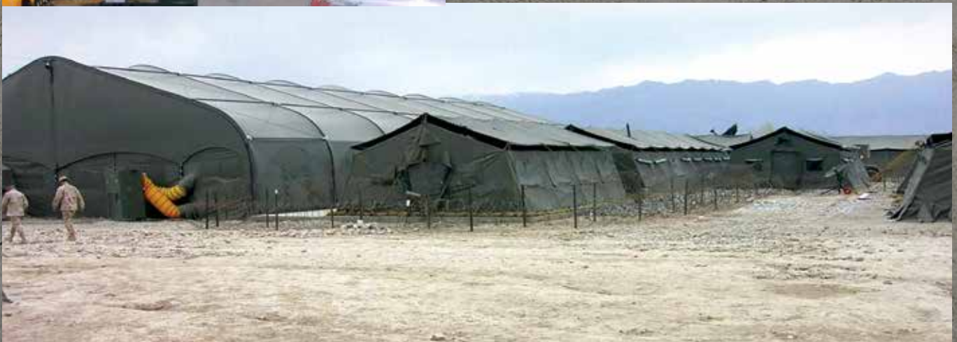
Tents erected alongside the JOC housed staff sections of the CJSOTF-A headquarters.