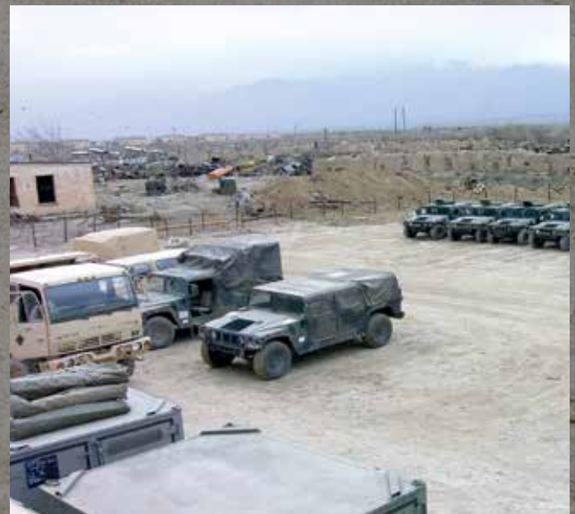
The Motor Pool constructed by the Maintenance Platoon, 3rd SFG Group Support Company, May 2002.