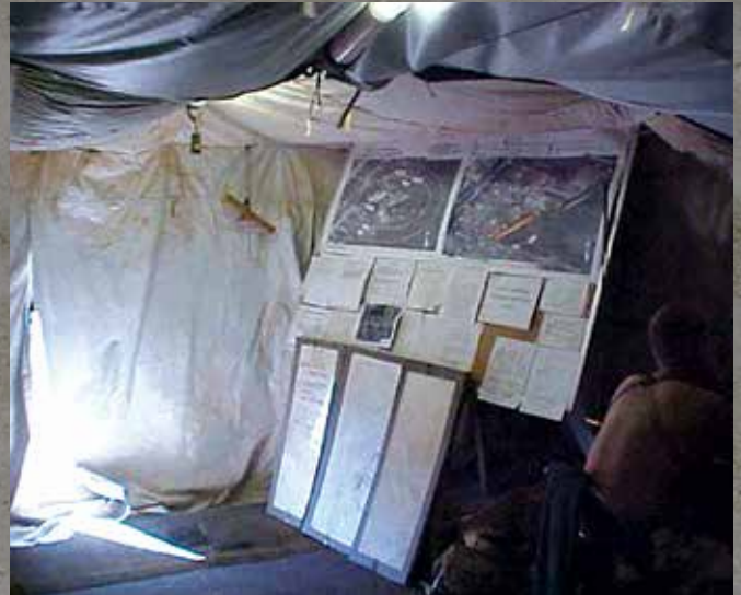
The BDOC coordinated and directed the defense of the camp with all elements occupying Bagram Airbase.