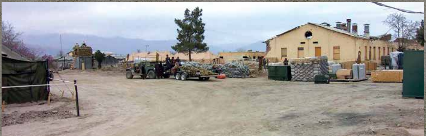
Area occupied by an Operational Detachment – 'B' (ODB) of the 20th Special Forces Group, April 2002. They 're-purposed' a dilapidated Soviet-era building.