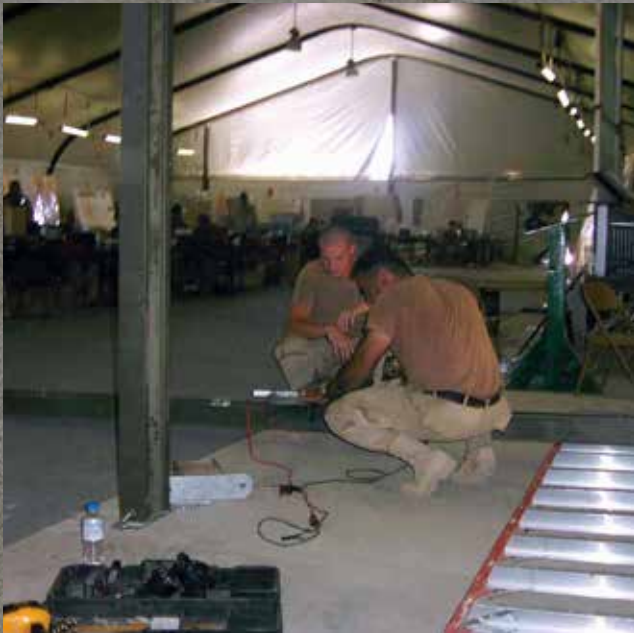
Construction of the large utility tent housing the Joint Operations Center (JOC) and other office spaces.