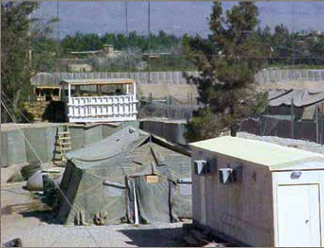
View of temporary guard towers constructed atop a HESCO wall. HESCOs filled with dirt and gravel were used for perimeter and interior walls. They were replaced in later years by concrete T-walls (large concrete forms in the shape of inverted 'T's). The advantages of HESCOs are that they can be easily sited and filled, and provide excellent protection from direct-fire weapons and improvised explosive devices (IEDs).