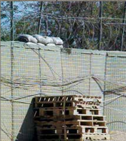
An expedient 'step-up' fighting position prepared behind a HESCO exterior wall in the CJSOTF camp at Bagram Airbase. The pallets allowed soldiers to engage enemy outside the perimeter wall behind sandbag protection. Several of these augmentation fighting positions were sited inside the camp area to cover critical parts of the perimeter.