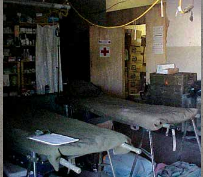
Interior of the CJSOTF-A aid station, organized to receive casualties in the event of an attack. The most severe casualties would be transported to the Emergency Medical Station (EMS) or evacuated to the nearest hospital as appropriate.