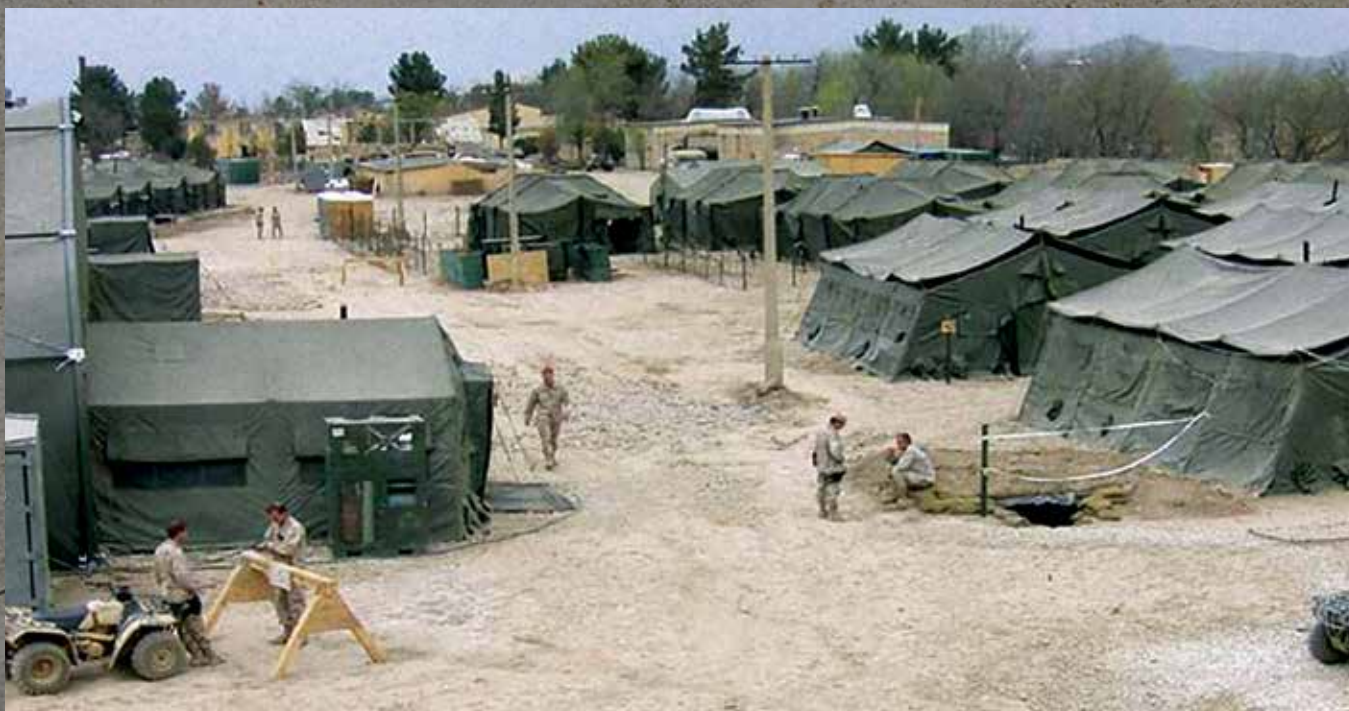
View of 'Camp Abel' looking out over billeting and working area tents, May 2002. ----->

1 Text cleared by USASOC G-3X and SSO 12 Aug 2015.