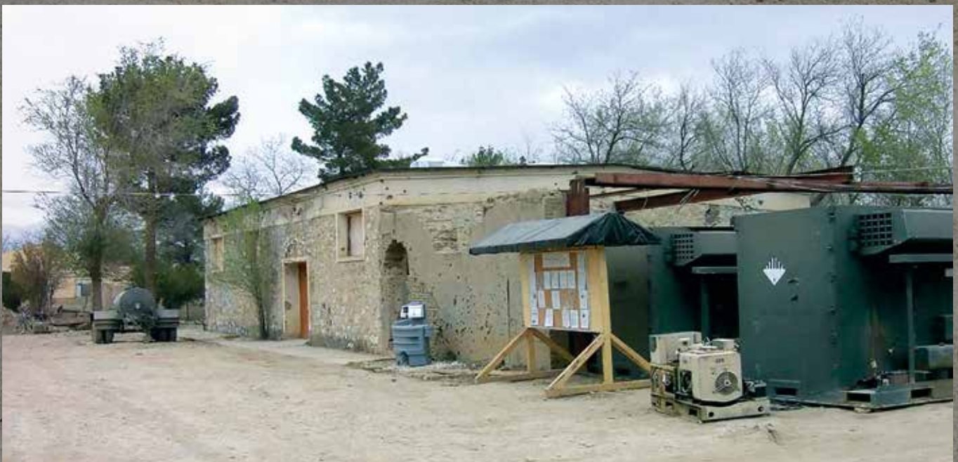
Soviet/Russian legacy building initially housed the CJSOTF kitchen and functioned as the cook's quarters. Messing initially took place to the left of the building, where tentage served as the CJSOTF-A Dining Facility on Camp Abel. Later, a more modern building was constructed.