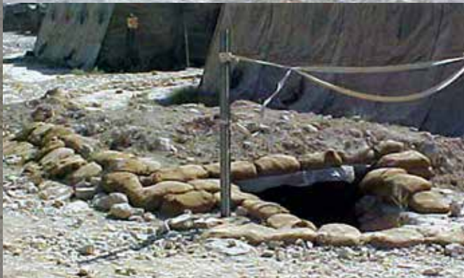
Two types of underground bunkers provided soldiers with protection from indirect fire. These were located near sleeping areas and work stations for use during rocket or mortar attacks. The troops regularly rehearsed emergency actions.