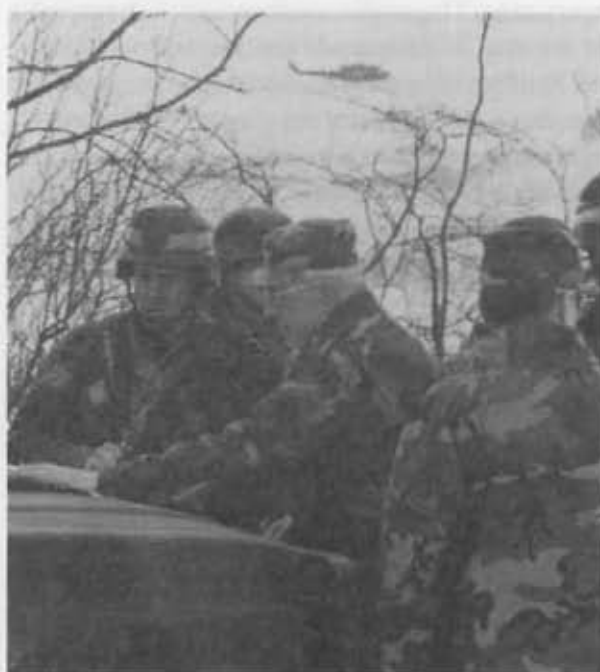
General Galvin during NATO exercise

Hopefully, we are seeing the development of a trend