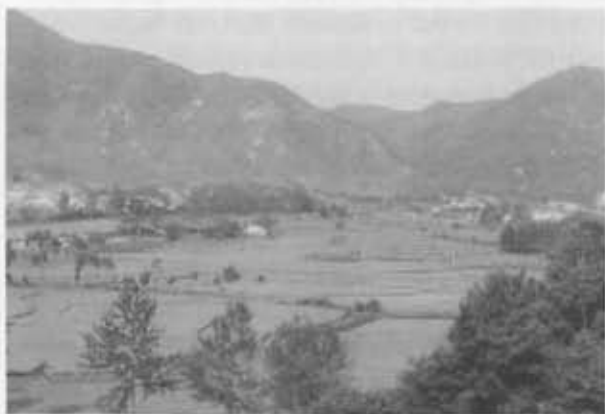
The peacefulness of the Chorwon Valley belies its significance as a historical invasion route to the south. It was studied extensively during WARFIGHTER exercises in Korea.