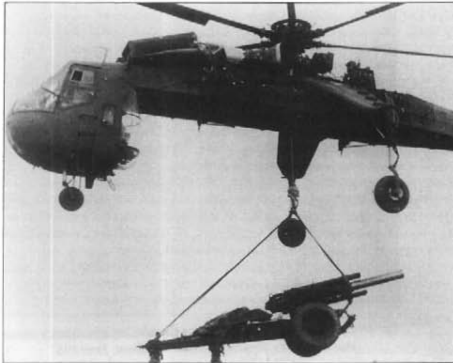
CH-54 Sky Crane (Tarhe) lifting a 105-mm. howitzer at a fire base in Vietnam.

venerable AH-1 Cobra and the newer AH-64 Apache are more heavily armed and now provide firepower and standoff capability heretofore not envisioned. Both of these aircraft more than proved their mettle in the recent Gulf War. Other helicopters with better lift and supply capabilities, such as the UH-60 Black Hawk, have been integrated into all facets of helicopter doctrine. Airmobility tactics, helicopter lift capability, aerial surveillance, and aeromedical evacuation techniques all have been refined to meet the contemporaneous needs of the U.S. Army. The visionaries of the