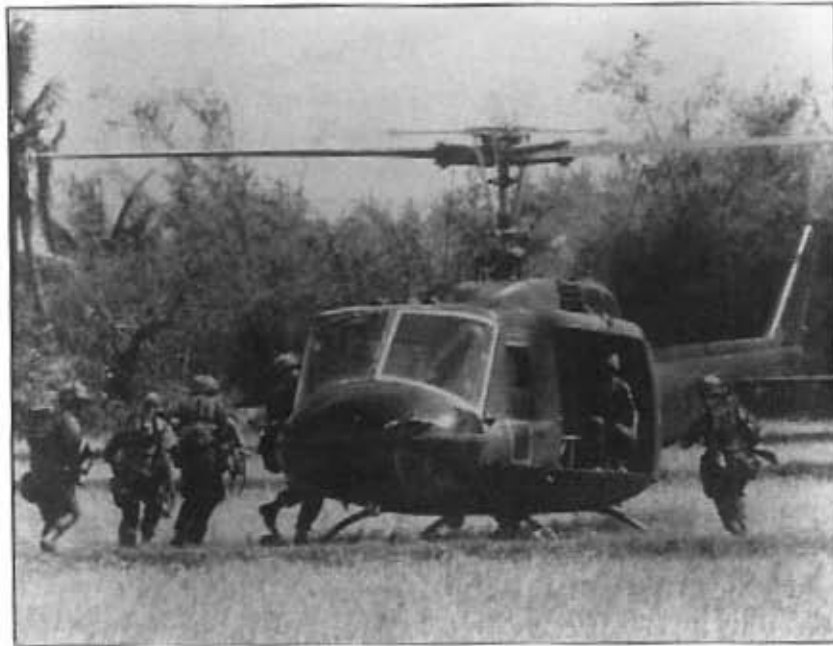
UH-1B Bell (Huey) picking up 1st Air Cavalry reconnaissance troops north of Bong Son Plains, South Vietnam, June 1967.

within and without military circles as to its efficacy and results. The operation, however, served as a "lessons learned" study for the Army, in that it brought out the need henceforth to have more heavily armed helicopters in such operations, as well as attendant and better close air coordination with the Air Force and integration of supporting fire. (10)