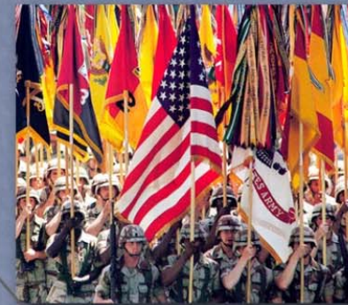
LINEAGE AND HONORS--PART OF THE PAGEANTRY OF ARMY HISTORY