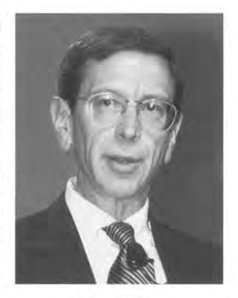
Robert J. Einhorn

I'm going to talk a little bit about the future of U.S. policies in the area of nonproliferation. With the presidential election just about seven weeks away, and clearly real differences existing between the two presidential candidates on how to fight proliferation, it's hard to predict with any precision the kinds of policies that the United States will pursue in nonproliferation in, say, about six months time. Indeed, even if we knew today who is going to win the election, it would be difficult to predict U.S. policies. We can only speculate, for example, on whether a second Bush administration would continue with the relatively pragmatic multilateralist approach that the current Bush administration has taken in recent months, or whether it would revert to its earlier pre-Iraq emphasis on more