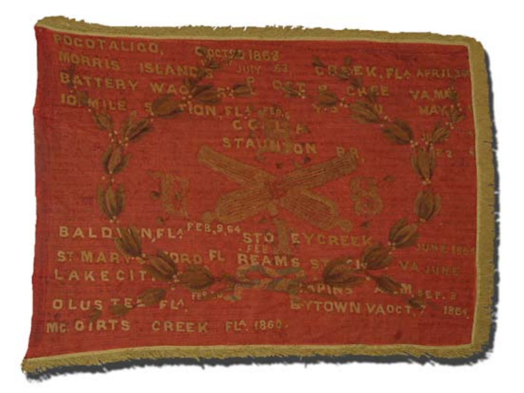
Civil War Flag (nonregulation), with battle honors for Battery B, 1st Regiment of Artillery